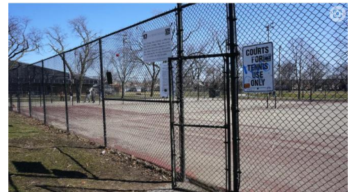
Shabbona Park, 6935 W. Addison St. has five tennis courts that no longer function, as seen March 27, 2023