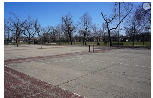
Two of the five will be turned into four pickleball courts.

Shabbona Park, will get four pickleball courts and three new tennis courts, as shown on the design by the Chicago Park District.